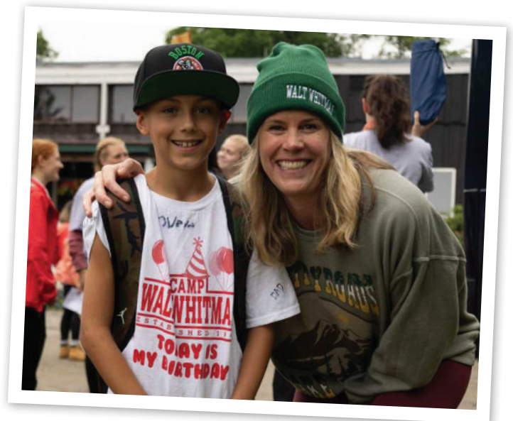
Birthdays at camp are extra special

Special Situations: If an emergency or special situation at home necessitates speaking with your camper, please call and speak with our Office Manager, or if after hours, leave a message. After 9 p.m., our lines are answered by voicemail that is checked regularly until midnight by the Senior On Duty. Please do not call after 9 p.m. unless it is a true emergency.